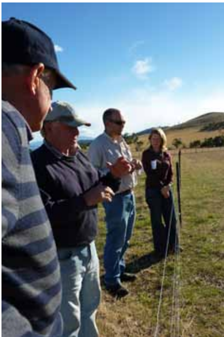
By supporting innovative farmers undertaking regenerative landscape management practices, we can restore the Australian landscape