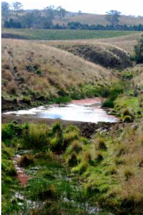
Installing interventions that mimic nature assist in the build up of sediment and the capture of water in the soil

Returning to such natural hydrological processes can restore riparian areas, recharge flood plains and make water available for uptake by plants and animals over longer periods of time.