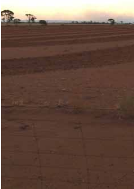
Over-reliance on chemical inputs and non-regenerative practices have contributed to degradation of Australian agricultural land