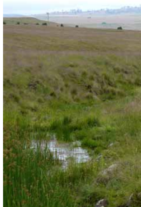
Slowing the flow of water across the landscape helps to restore riparian areas

Australia is the driest inhabited continent with variable rainfalls. Whilst many regions in Australia received very healthy rainfalls in 2010, the 2010 CSIRO/BOM State of the Climate report highlighted that reduced rainfall in eastern and southern Australia, together with more intense rain events are likely to be the norm in the future 19 . Drastic flood events have already been experienced in northern Australia for consecutive years with devastating results.