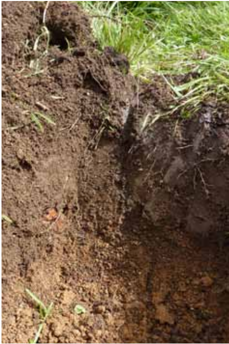
Soil organic matter forms through the breakdown of organic materials on the soil surface and below the ground. It comprises approximately 50% carbon

Every gram of soil organic carbon can hold up to 8 grams of water.