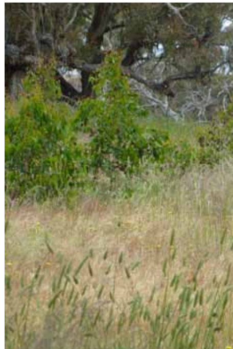
Vegetation of all types contributes to carbon sequestration and restoration of hydrological cycles

Nutrient deficient soils lead to nutrient deficient plants, ultimately the food source on which we survive. Massive mineral depletions in fruit and vegetables were identified over a research period 1940 to 1991. The food we eat today is less nutritious than it was before World War II 29 .